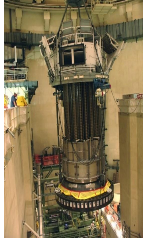
NextGEN RPI Installation on the Head