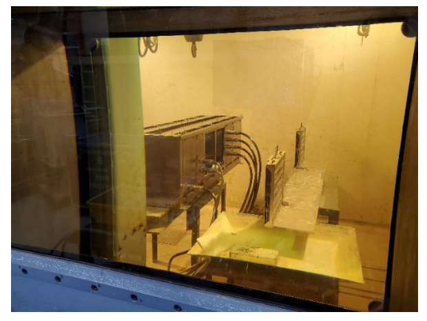
NextGEN RPI Radiation Testing – Passed 750kRads