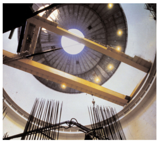
250-Ton Polar Crane

Polar Cranes or Reactor Building Cranes Polar cranes are designed for heavy lifts and operate on circular rails inside pressurized water reactor (PWR) reactor containment buildings. In order to overcome potential binding issues when operating on a circular track, PaR Nuclear has successfully