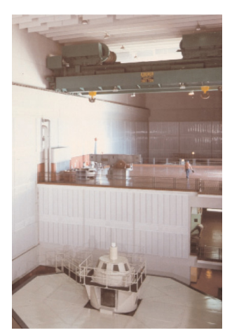
Turbine Building Crane

Turbine building cranes in nuclear power plants are large, typically in the capacity range of 200 tons or more, often with long spans. They are frequently used to handle outage support equipment in addition to turbine and generator maintenance.