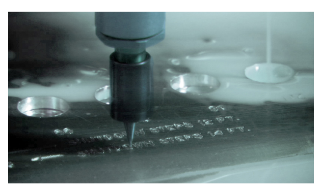
Westinghouse provides precision CNC engraving on a variety of materials.