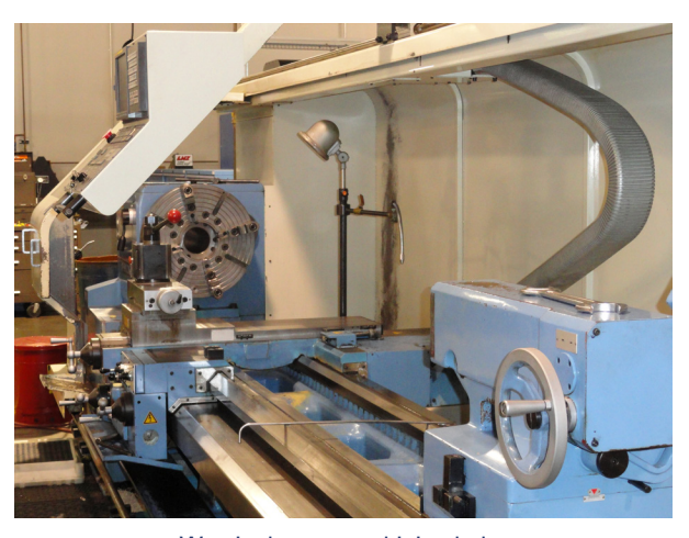
Westinghouse machining lathe