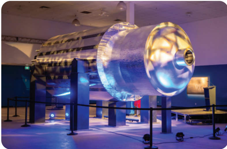
Full-size eVinci™ Microreactor model at Saskatchewan Research Council

SRC has a long history of providing support and leadership to the uranium/nuclear industry in exploration mining and milling, mine remediation and environmental protection. SRC owns and operates the world's largest uranium laboratory and successfully operated a SLOWPOKE-2 nuclear research reactor for over 38 years before safely decommissioning it in 2021.