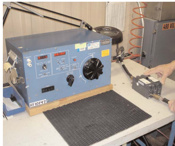
MCCB undergoing instantaneous current testing during dedication

The new Classic MCCBs provided to our utility customers have several enhanced internal components that meet or exceed the quality of the original design and operating requirements. Those components