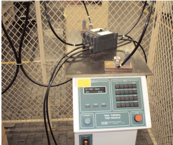
MCCB undergoing thermal testing at 300% rated current during dedication