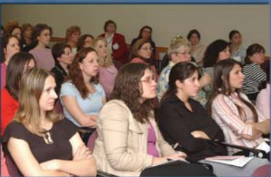
Westinghouse WIN, Pittsburgh Chapter General Meeting