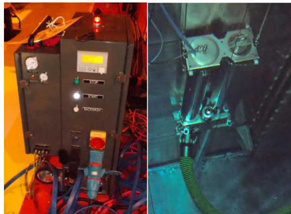
AMFM-B500 control unit and installation