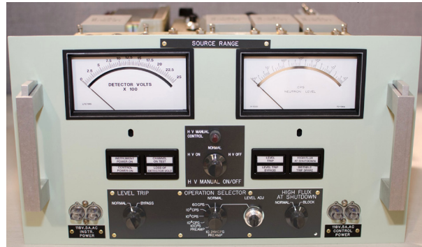
New source range drawer with factory-installed high voltage cutoff upgrade