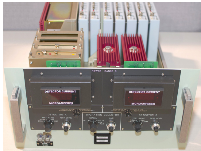
Digital meters upgrade – Factory-installed during a new drawer build