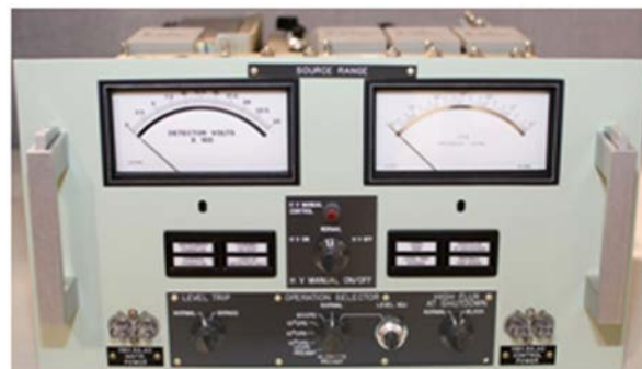
High voltage cutoff upgrade factory-installed during a new source range drawer build.