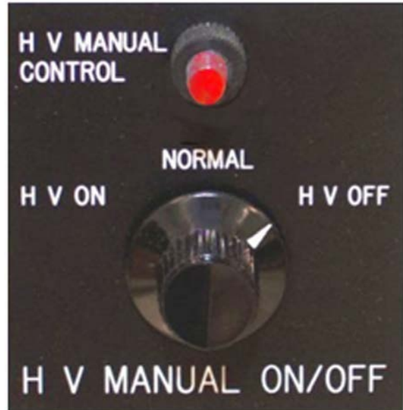
Front panel indicator illuminates when high voltage control switch is not in normal position.

Westinghouse can provide licensing support, field change notices, drawing updates, technical manual updates and installation services.