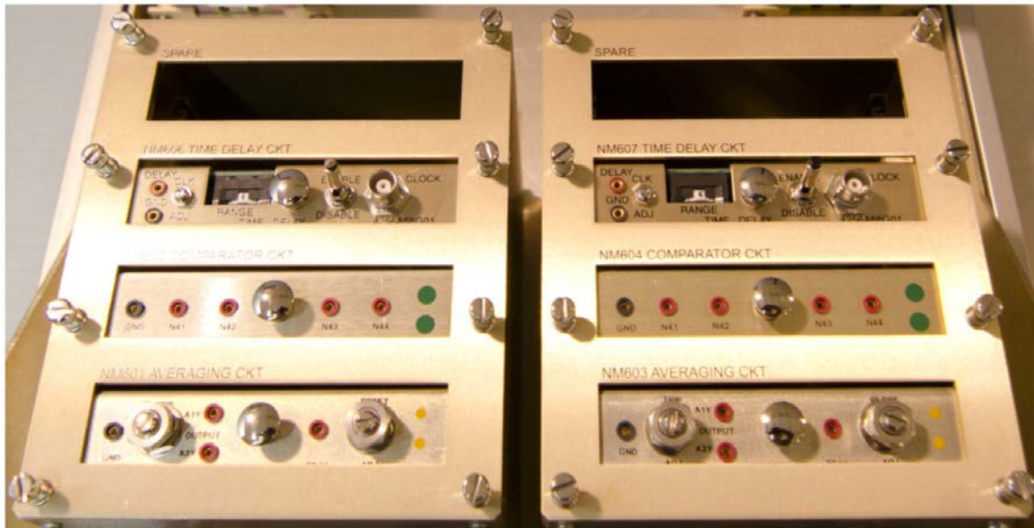
Two cards are installed in spare slots in the flux deviation drawer, one for the upper section deviation alarm and one for the lower deviation alarm.

Flux deviation time delay modifications have been installed in 7 reactor units. This proven design has been in use for more than 25 years.