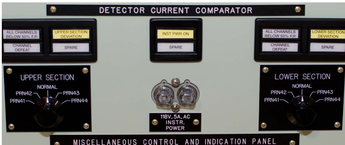
Nuisance flux deviation alarms due to short duration signal spikes can be eliminated.