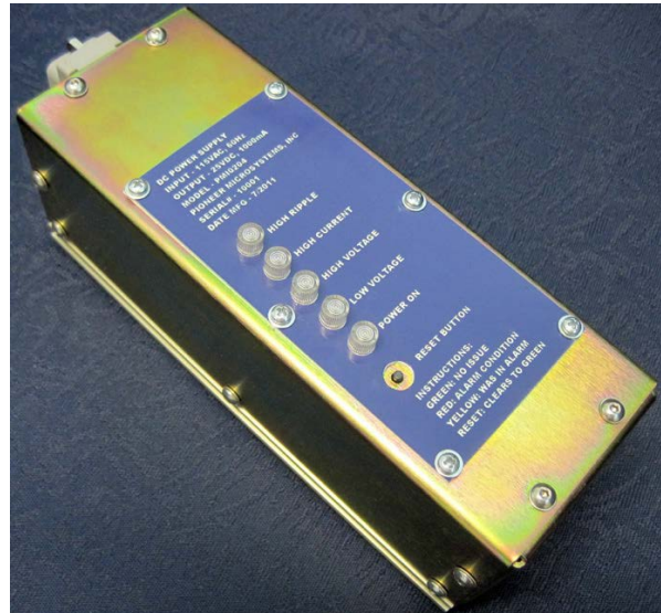
The updated power supply can be used in the NIS source range, intermediate range and power range B drawers.

The updated power supply is seismically and environmentally qualified as class 1E in accordance with the IEEE 323-1983 and 344-1987 requirements. It is also qualified to the electromagnetic and radio frequency interference requirements of Regulatory Guide 1.180.