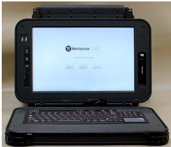
Portable Rod Drop Test Computer