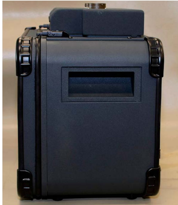
Rugged, Militarized Chassis

The technology is successfully installed at five Westinghouse operating plants.