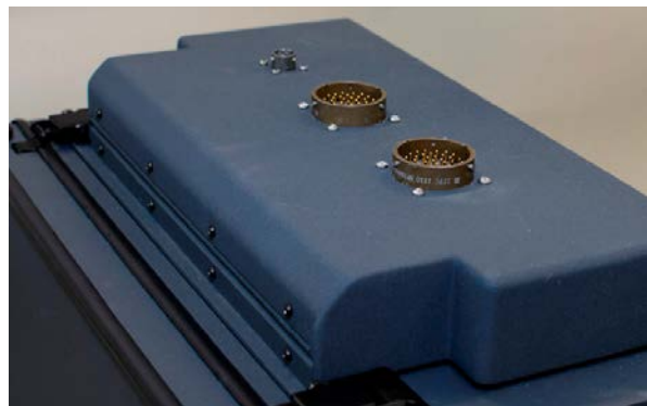
Hardware Connections and Cabling Included

Windows is a registered trademark of Microsoft Corporation in the United States and other countries. LabVIEW is a trademark of National Instruments. This publication is independent of National Instruments, which is not affiliated with the publisher or the author, and does not authorize, sponsor, endorse or otherwise approve this publication.