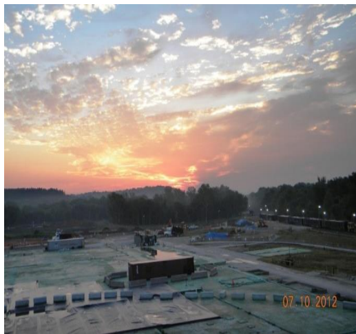
Hematite Nuclear Fuel Plant Decommissioning Project Hematite, Missouri (USA)

Westinghouse also provides comprehensive, integrated services and state-of-the-art solutions for spent fuel and the treatment and handling of radioactive waste, and offers proven solutions for the interim storage and final disposal of low-, intermediate- and high-level waste.