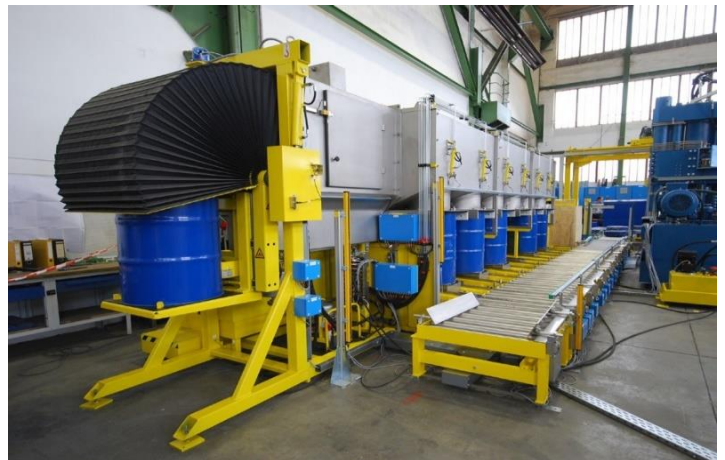
Sorting box and super compactor