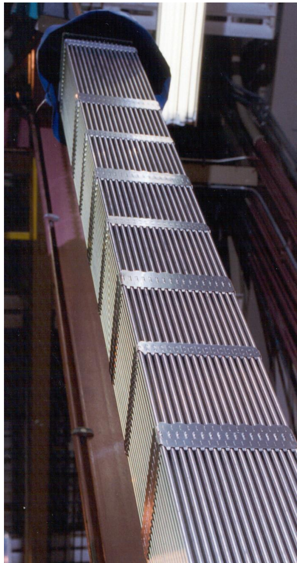
Optimized ZIRLO Tube Assembly Ready for Inspection

As of year-end 2015, Optimized ZIRLO clad fuel has operated in over 41 plants. Full reloads of Optimized ZIRLO clad fuel are currently operating in 27 units worldwide. By the end of 2015, nine units will have full cores. Over 4900 assemblies have been delivered with Optimized ZIRLO representing over 1,178,000 fuel rods in operation or discharged.