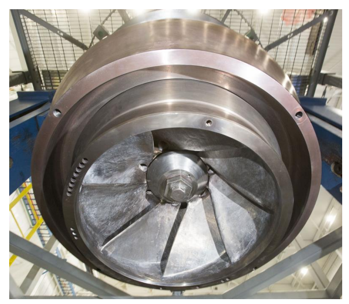
Westinghouse Model 100 Impeller view