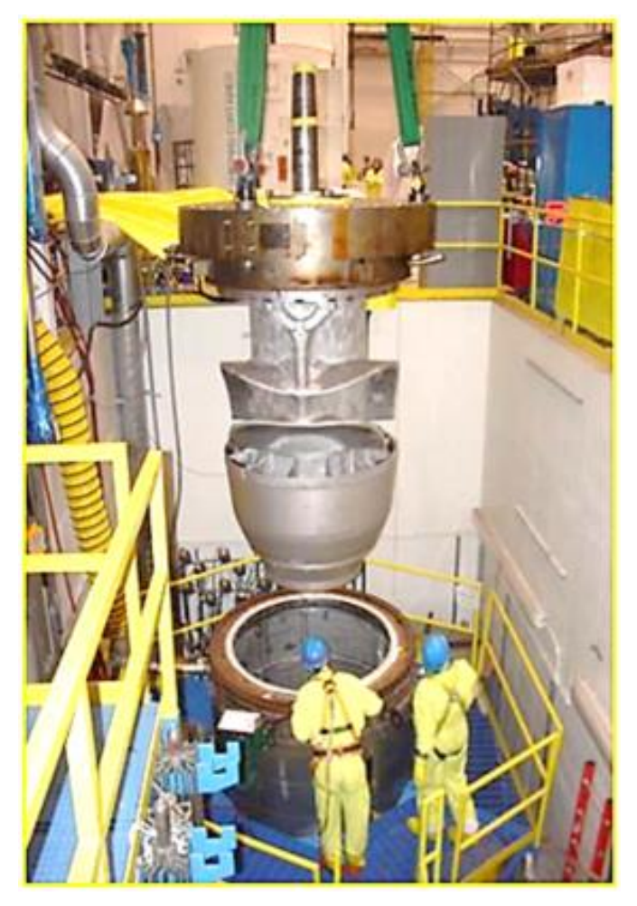
Westinghouse RCP exiting chemical decontamination

With comprehensive RCP and motor field services, Westinghouse has helped utilities meet the operating demands of today and be better equipped to meet the challenges of tomorrow.