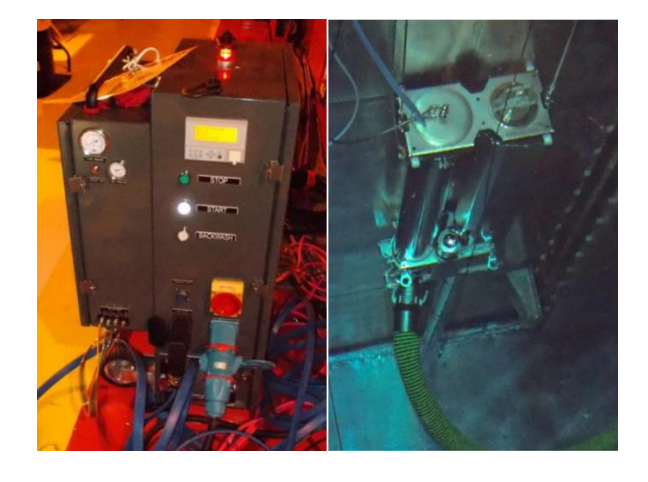
AMFM-B500 control unit and installation