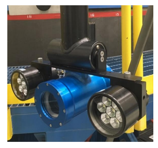
BlueRad Inspection Camera System