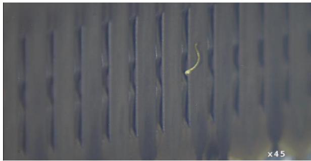
Spent Fuel and Core Gap Inspections