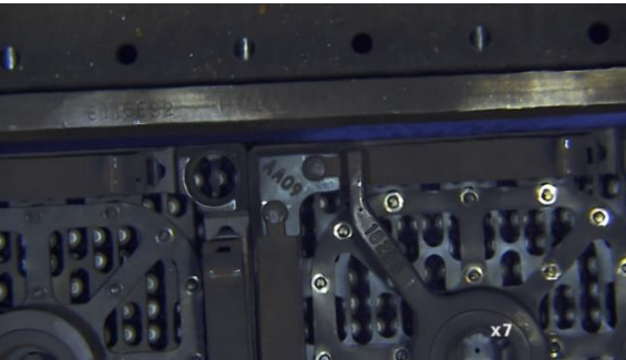
Core Plate Inspection