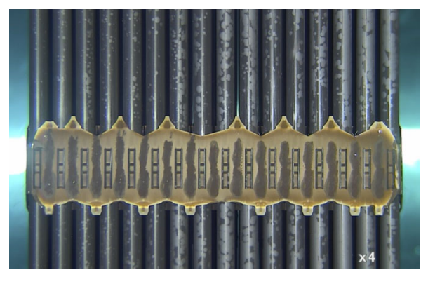
Fuel Assembly Inspection

Westinghouse has been providing 5-Sided Fuel Inspection Services for many years utilizing various technology. The BlueRad<sup>™</sup> 5-Sided Fuel Inspection System is designed and built for fuel inspectors, by fuel inspectors and combines the latest in optics technology with our extensive fuel inspection experience resulting in an innovative camera for your inspection needs.