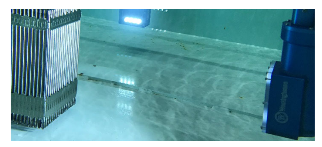
One 5-Sided Camera Viewing Fuel Assembly

Westinghouse has developed a shielded BlueRad<sup>™</sup> 5-Sided Fuel Inspection System designed and built from the ground up to provide the best possible visual examination of each fuel assembly during or after core offload.