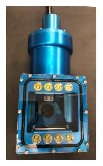
BlueRad<sup>™</sup> Shielded Camera

Westinghouse has sold and used the BlueRad<sup>™</sup> 5-Sided Fuel Inspection System at multiple customer sites. The clarity of the high-definition image and the ease of use of the system is just some of the positive feedback received.