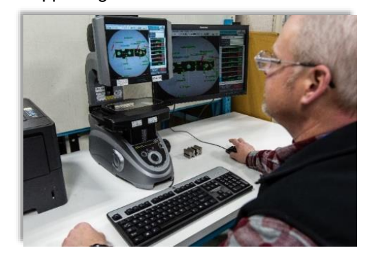
Digital Image Dimensional Measurement