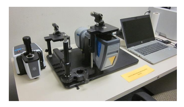
FTIR Spectroscopy Analysis