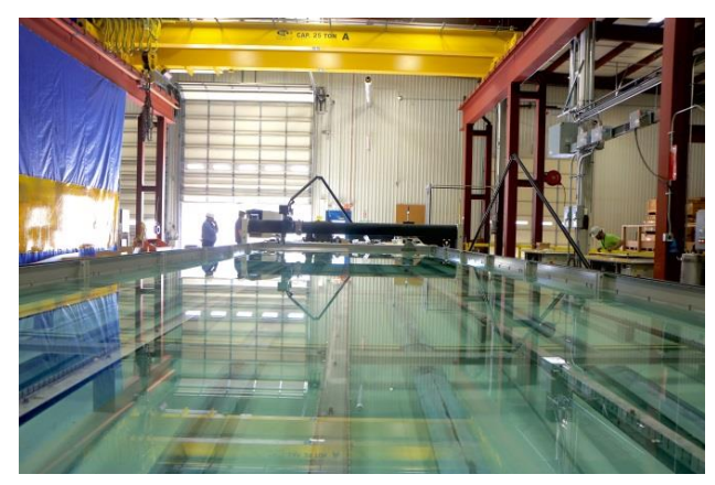
Water jet machining center under two 20-ton cranes.