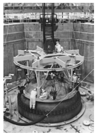
U.S. plant outage showing six TENSOR™ tensioners, a rigid pole system and head lift rig/carousel