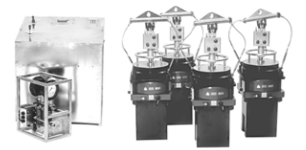
Four tensioners, a control console and a distribution manifold

An external handle operates a gear mechanism that turns the nut down until it rests on the washer, seated on the flange surface. When the hydraulic pressure is released, the stud load, imparted by the tensioner, is restrained by the nut.