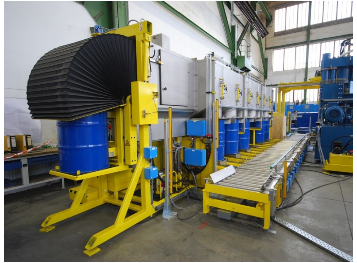
Sorting box and super compactor