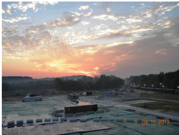
Hematite Nuclear Fuel Plant Decommissioning Project Hematite, Missouri (USA)

Westinghouse also provides comprehensive, integrated services and state-of-the-art solutions for spent fuel and the treatment and handling of radioactive waste, and offers proven solutions for the interim storage and final disposal of low-, intermediate- and high-level waste.