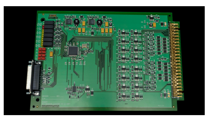
New SSPS Memory Card