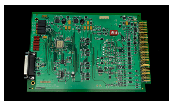
New SSPS Semi-Automatic Tester Card

Westinghouse Electric Company 1000 Westinghouse Drive Cranberry Township, PA 16066