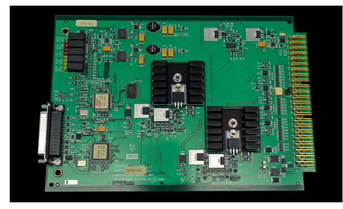
New SSPS Under-voltage Driver Card

Environmental – IEEE 323-1983 Seismic – IEEE 344-1987 Electromagnetic compatibility (EMC) and radio-frequency interference (RFI) – Regulatory Guide 1.180, Revision 1