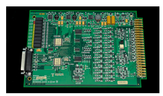
New SSPS Universal Logic Card