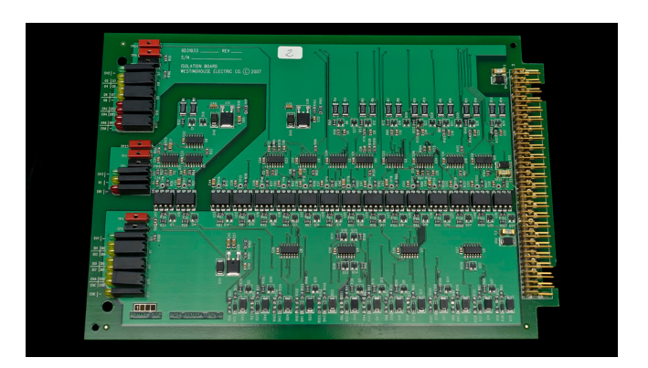
New SSPS Isolation Card