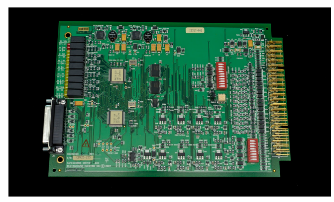
New SSPS Safeguards Driver Card